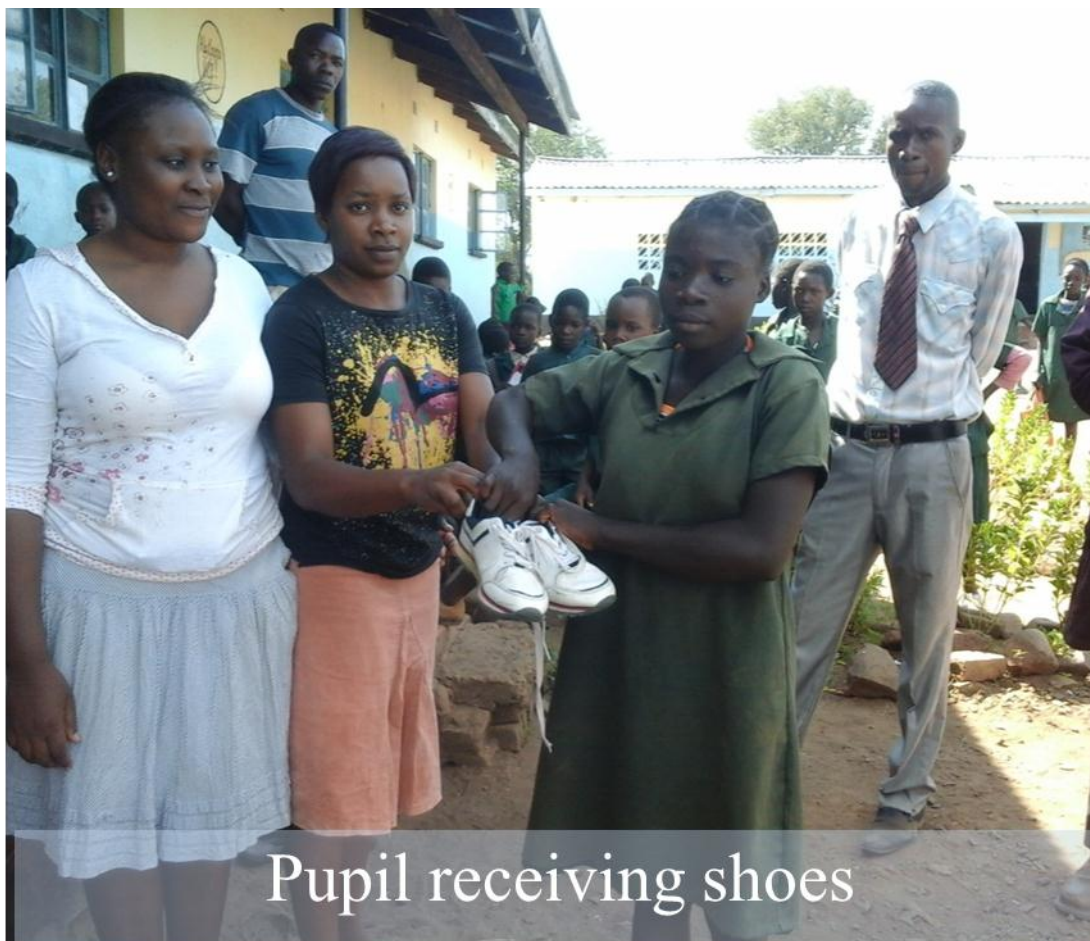
Pupil receiving shoes