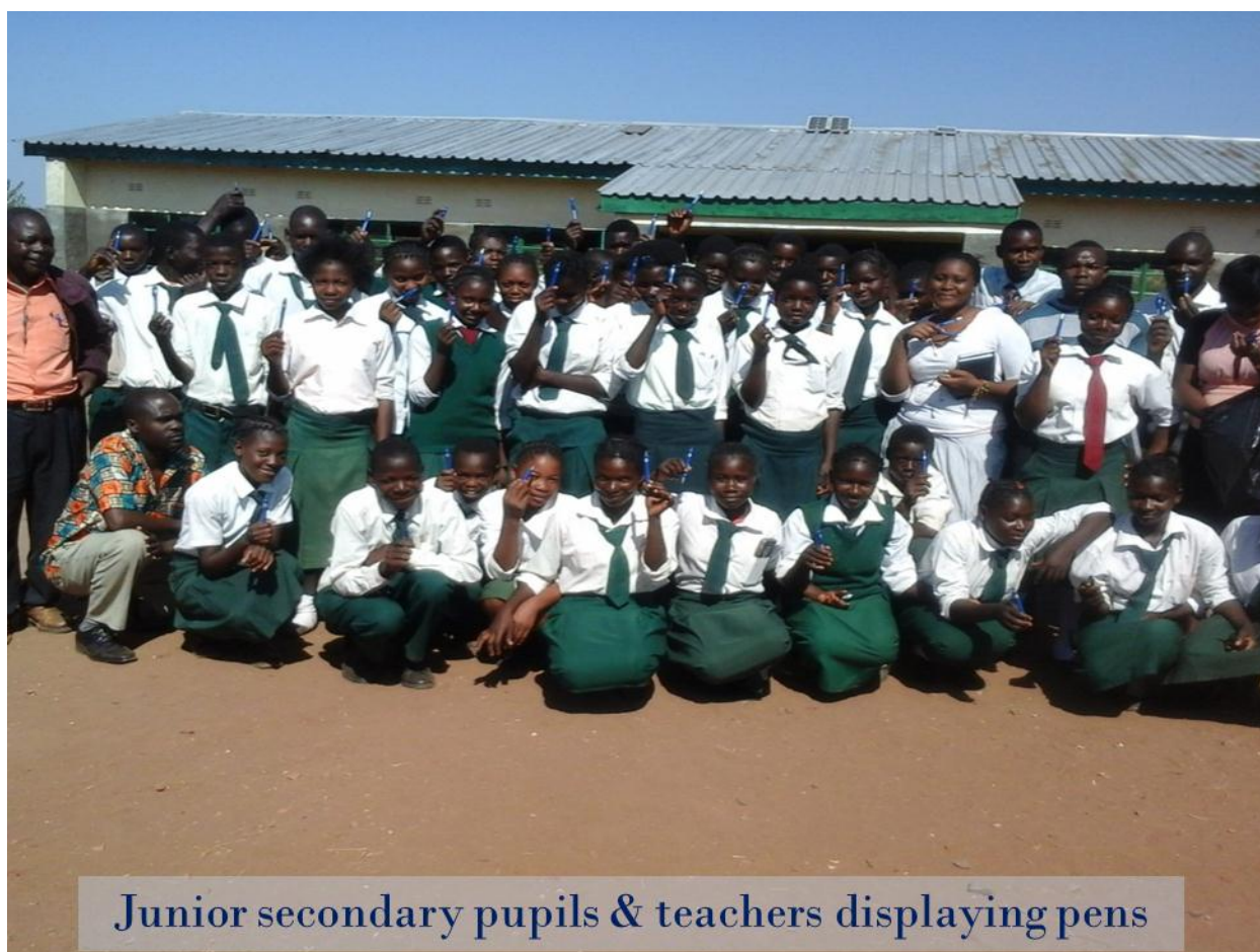
Junior secondary pupils & teachers displaying pens