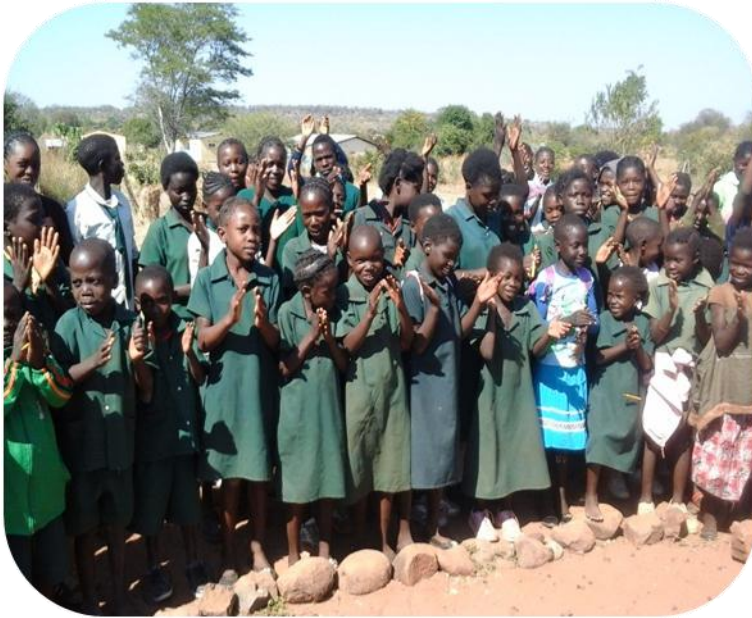
Pupils happy while waiting for the distrubution

Below are some of interesting moments during distribution exercise.