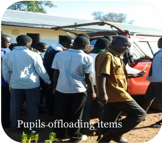
Pupils offloading items