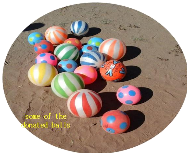
some of the donated balls