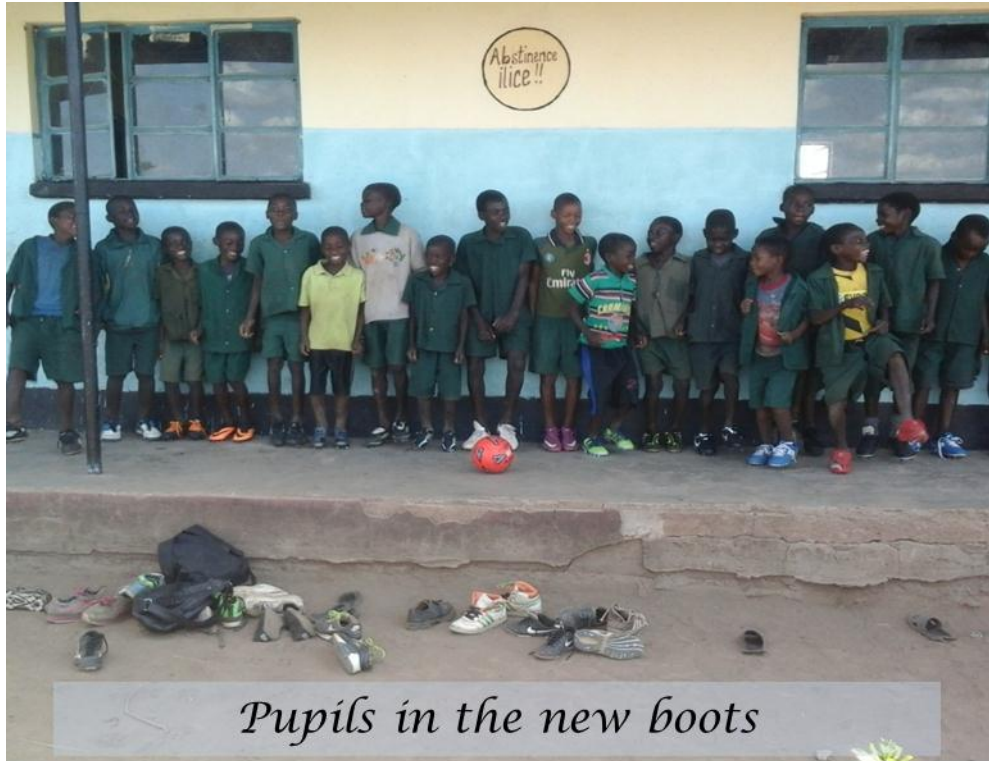
Pupils in the new boots