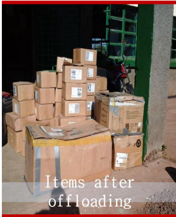
Items after offloading